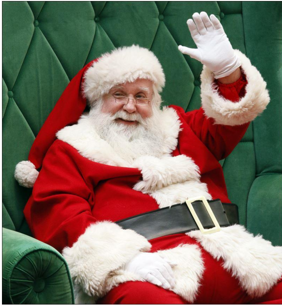
Wave to Santa