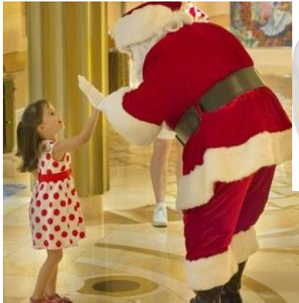
Give Santa a High Five