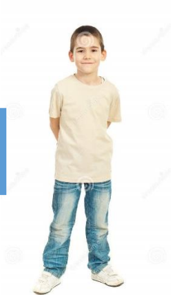
Stand Far Away