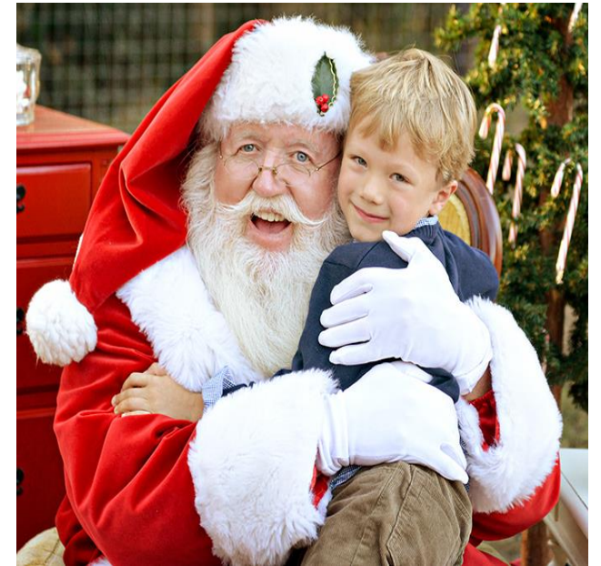
Sit and Hug Santa