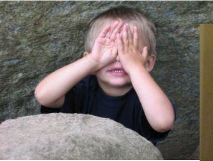
Cover My Eyes